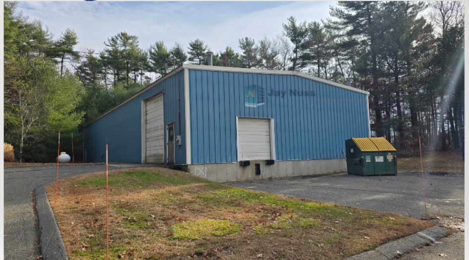
243R Oak Street 5,025 Square Foot Flex Building With Potential For An Additional 15,000 Square Feet